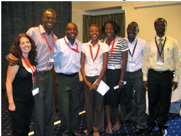
FACES Team at the UoN Collaborative Meeting in Nairobi, January 2010