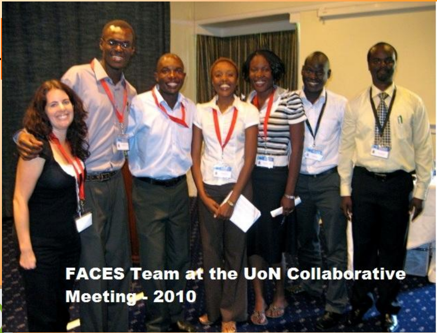
FACES Team at the UoN Collaborative Meeting - 2010